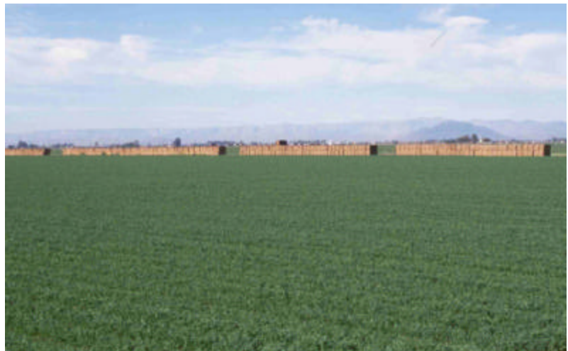
Modern alfalfa production field and alfalfa stacked ready for shipping to dairy markets. This field is in the Imperial Valley of California.

Alfalfa is currently an important crop in all 11 western US states of Arizona, California, Colorado, Idaho, Montana, Nevada, New Mexico, Oregon, Utah, Washington, and Wyoming. These states total 7.4 million acres, or 31.2% of the US