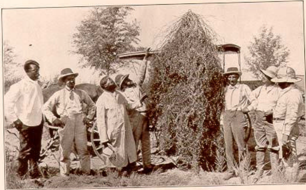
Six Months' Growth of Alfalfa Foliage

One cannot ignore the role that western farmers have played in the historical development of alfalfa, and its current position as a top crop in Western states. Alfalfa seems to have 'always been there' as a key mainstay crop for western ranches. It is often considered a 'bread and butter' crop that has paid a lot of bills and sustained many a landowner and ranch hand. This has been true from the earliest development of western ranches and farms. Although many other crops have also gained importance over the past 150 years, alfalfa has retained its important stature as a top economic crop in the West today.