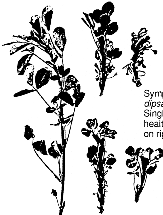
Symptoms of D. dipsaci on alfalfa. Single shoot on left is healthy; four shoots on right are diseased.

As mentioned previously, five species of root knot nematode are associated with alfalfa in California. These species have wide and variable host ranges, different temperature optimums and different degrees of pathogenicity. In addition to causing problems on alfalfa, because of their wide host ranges, they create problems for many susceptible crops that might be grown in rotation. The range of temperatures for development of M. incognita , M. arenaria , and M. javanica is approximately 65 to 85 F (18 to 30 C) while that for M. hapla and M. chitwoodi is approximately 41 to 77 F (5 to 25 C). Under these conditions, root knot nematodes can complete a generation in 4 to 6 weeks. The pathogenic situation for M. chitwoodi is further complicated by its having at least two morphologically indistinguishable races; only one of which is known to reproduce on alfalfa. The alfalfa race is not known to be widely distributed in California at the present time.