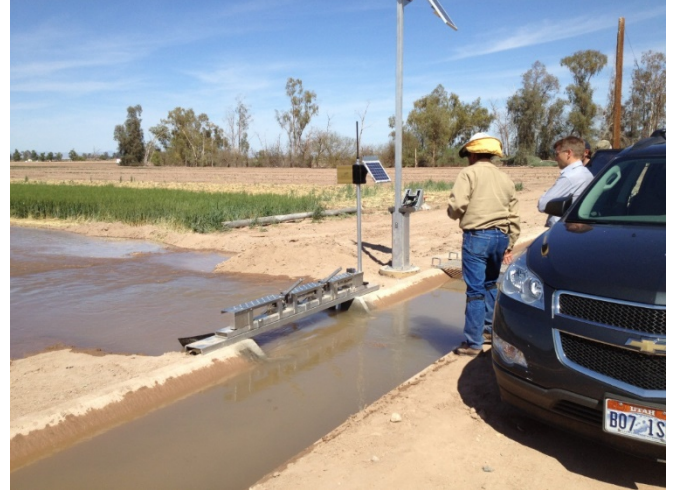
Figure 1. Irrigation events using automated gates at DREC

Figure 2 below shows a summary of advance and recession curves for one of the germination irrigation events at DEC. The objective of this irrigation event is to provide no more than 1.5 to 2.5 inches of water for germination and eliminate surface runoff to minimize the losses of sediments in runoff water.