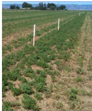
Figure 2. Multiple sensor poles located along the length of a check to provide an alert to the irrigator to exactly when to cutoff inflow to reduce tail discharge.

0.1325 acre-ft/acre can be realized per irrigation (Upadhyaya, 2013). For a typical 300 acre farm with five irrigations per season the water savings can be a significant 170 acre-ft to 200 acre-ft.