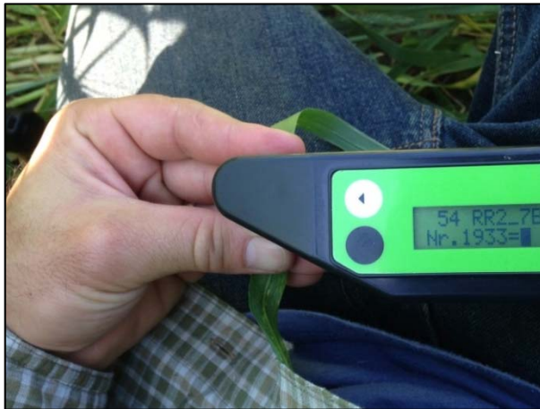
Image A. AtLeaf chlorophyll meter.