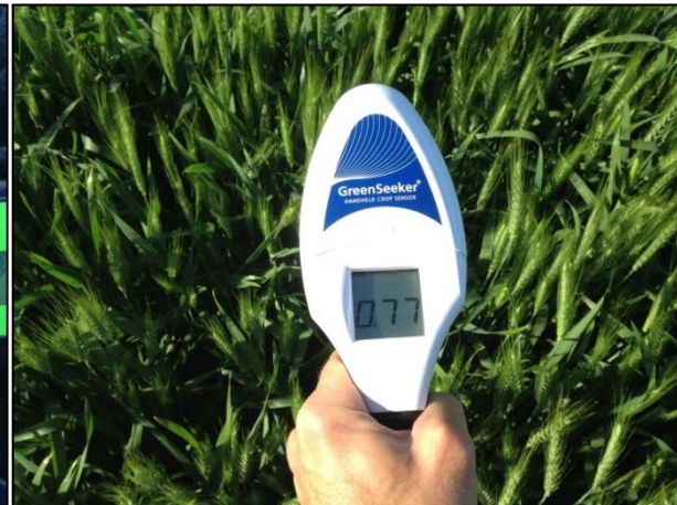
Image B. Greenseeker handheld NDVI meter.