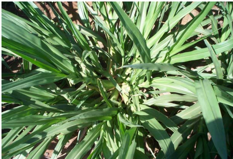
Figure 1: Elephant grasses ( Pennisetum sp ) grows in clumps or stools ( top photo ) and have an upright growth habit as they attain heights of greater than six feet ( lower photo )